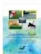
Landowners & Water Quality

Since the Perseid meteor shower is on we thought we would re-run this link: