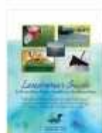
Landowners & Water Quality