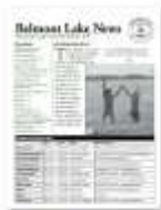
BLCA 2015 Newsletter